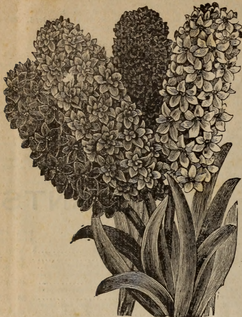
DOUBLE AND SINGLE HYACINTHS.